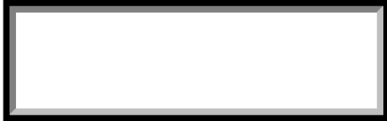
Figure 2. Typical Application